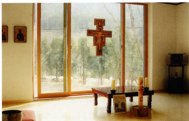
Korean Franciscan Brotherhood - Chapel in daytime

Praise be to God! The friary extension and remodelling to the Korean Franciscan Brotherhood of friary in Gangchon is now complete. After several years of fundraising we were able to start construction at the end of September last year. Work on the extension was completed by about February and the remodelling of the old building and landscaping was completed in time for our blessing and official opening on May 12. We are now enjoying living in much more comfortable surroundings and able to welcome guests much more conveniently.